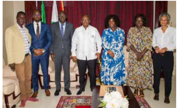
The WAPIS delegation had an audience with the President of the Republic of Guinea-Bissau, 19 October 2022, Bissau (Guinea-Bissau)

help operationalize the system in the country. This visit to Guinea-Bissau also kicked off training sessions in the use of WAPIS upstream of inauguration of the Data Collection and Registration Centre (DACORE), scheduled for January 2023.