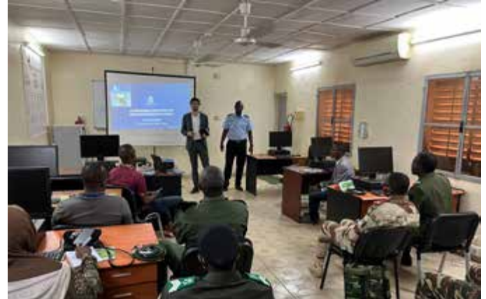
Awareness-raising session on use of the WAPIS system for Nigerian investigators in the National Police, Gendarmerie and National Guard, 3 November 2023, Niamey (Niger)

and the possibility of querying the national database system directly from the eight border posts already connected to the MIDAS system. Discussions for the connection are being finalized at national level.