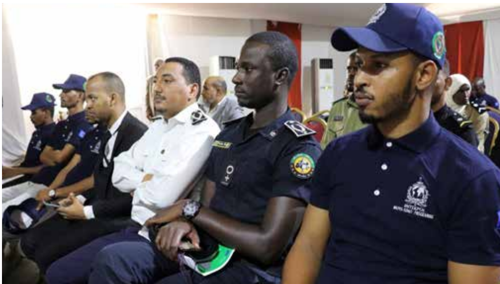
Awareness-raising session on the use of WAPIS, 25 October 2022, Nouakchott (Mauritania)

During the first quarter of 2023, several awareness-raising sessions will be organized in Togo, Senegal, Nigeria and Sierra Leone, again with the aim of popularizing WAPIS for a safer world and African region.