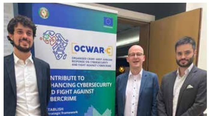
Presentation of the WAPIS Programme to the 2nd OCWAR-C meeting of Heads of Cybercrime Units in the ECOWAS region, 23 November 2023, Dakar (Senegal)

regional meeting of the heads of cybercrime units. The presentation to the heads of the cybercrime units was a great success and there was a very good response both in terms of requests for WAPIS connection to their units and the feedback received. In 2023, the two projects will work together on adding the cybercrime taxonomy to the national WAPIS platforms.