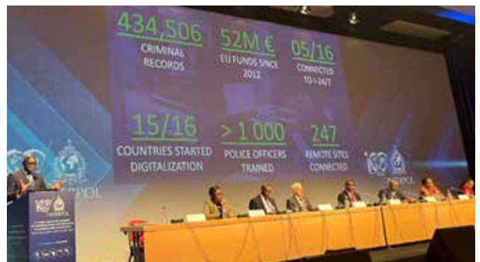
Africa Round Table at the 17th Annual Conference of Heads of National Central Bureaus (NCBs), 29 November 2022, Abidjan (Côte d'Ivoire)

implementation of the system so it can be used effectively in the context of consolidating the security architecture in countries and the fight against crime in all its forms. They were particularly keen to replicate WAPIS in other regions of Africa to ensure the continent is armed effectively in the fight against terrorism and transnational crime.