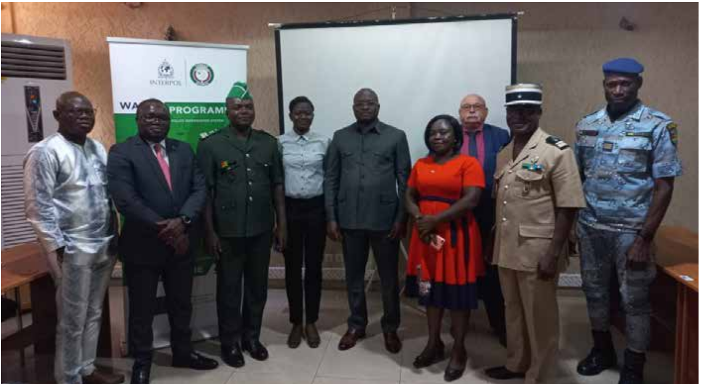
Workshop on validating the standard operating policy on use of WAPIS databases, 26 September 2022, Lomé (Togo)

At the end of the discussions and after changes had been made by members of the Committee, the WAPIS action plan was adopted and guidelines given on its implementation. Togo is therefore continuing its inexorable march towards effective operationalization of WAPIS and continues to demonstrate the usefulness of WAPIS on the authorities' security agenda.