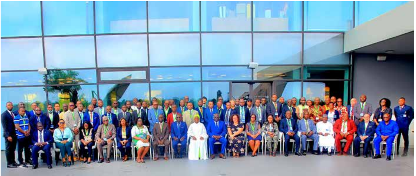
ECOWAS Expert Committee Meeting on the regional platform, 8 November 2022, Abidjan (Côte d'Ivoire)

There were more than fifty experts representing the ECOWAS countries, Mauritania and the ECOWAS Commission who attended this meeting. The conclusions from this meeting will be examined by ministers in charge of Security for ECOWAS and Mauritania before being definitively ratified by the Conference of Heads of State.